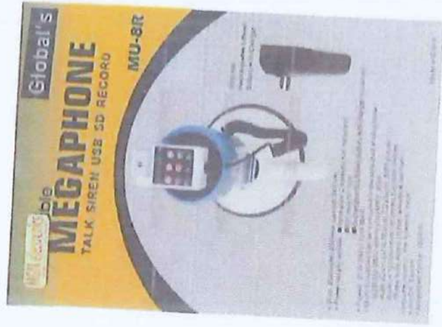
Global's Portable Megaphone 50w Rechargeable MU 8R Talk Siren USB SD RECORDING