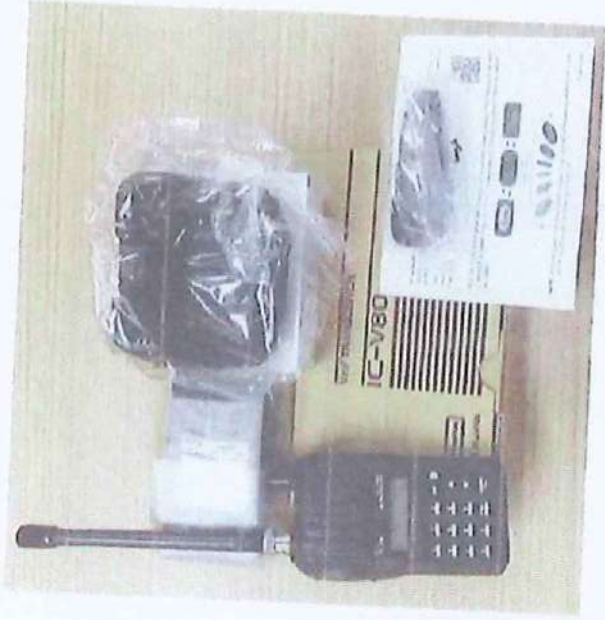
HT Icom V80 / ICV85 IC-V85 Lithium VHF handheld talky V85 ORI NEW JAPAN MURAH ORIGINAL Handheld Radio 5km